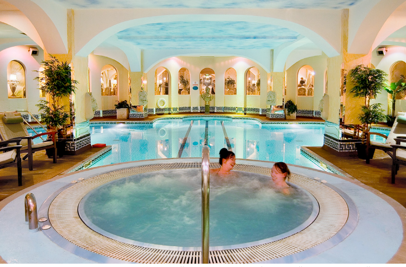
In addition to the some 100 luxury suites, over 100 different therapy and relaxing facilities on offer as well as several different restaurants there are various swimming pools providing for a high yield of wastewater in Hoar Cross Hall.