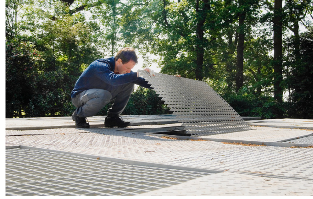
ATB staff regularly test and maintain the system in order to be able to guarantee a smooth process of the complete business operation.

SIONAL treatment system for up to 1.000 PT with the necessary modifications and the plant control was built, assembled and subsequently shipped to England. ATB technicians were soon on their way to England and, within only one week, installed the complete plant technology and the control electronics and commissioned the wastewater treatment plant. And following the extremely successful test run they registered a cheerful sigh of relief from the man who has recorded the secret of his success in the book "Take Action" and who lives the famous "from-dishwasher-to-millionaire-myth" daily before our eyes: self-made millionaire Steve Joynes.